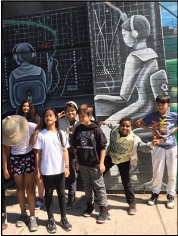
Students exploring community murals looking for ideas for 7 Teachings mural.