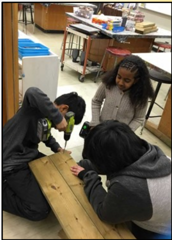
Students helping to build the indoor planter boxes.

The ESD committee has worked hard over the last two years creating spaces for students to interact with nature.