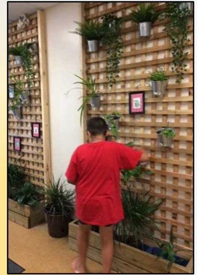
Indoor learning space with a student helping water the living wall.

The ESD is working with students to develop a Seven Teachings mural to be incorporated into the outdoor learning classroom.